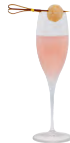
LYCHEE ROSA $160

Champagne, Lillet Blanc, Elderflower 香檳, Lillet 開胃酒, 接骨木花