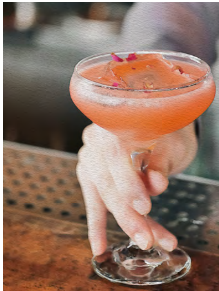
FLORAL DIAMOND $120

Give yourself an opportunity to taste a delicate cocktail made of non-alcoholic beverage as the world's trendy premium brand - Lyre's