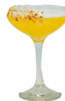
AMARETTO BUBBLES $160