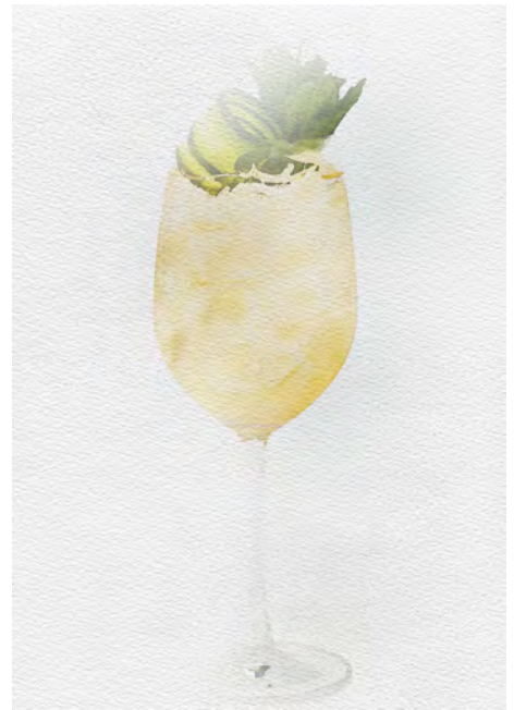
GARDEN FIZZ $160

A glass of bubbles will surely freshen up your cocktail drinks