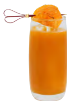
JUNGLE ICED TEA $158

Lyre's Dark Cane, Mint, Lime, Soda Lyre's 黑甘蔗酒, 薄荷, 青檸, 梳打