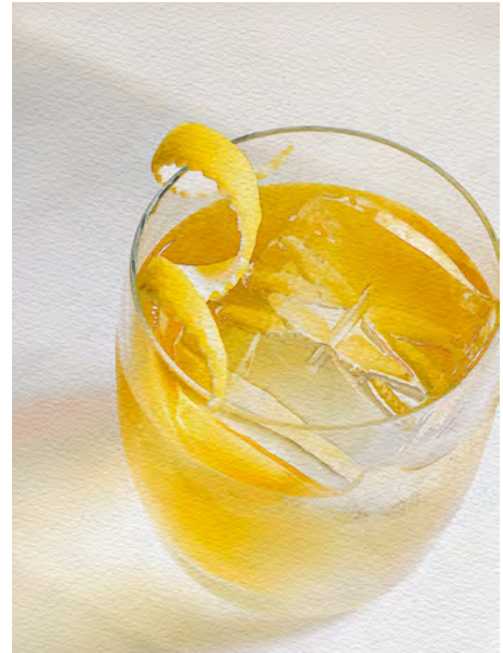
HONG KONG HERBAL TEA $168 Two Moons Five Flowers Tea Gin Longan Infused Lillet, Suze, Fig Two Moons 五花茶氈酒, 龍眼浸泡Lillet, Suze, 無花果