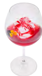
PETAL POP $138 Cocchi Rosa, Peach Passionfruit Elderflower Soda 粉紅餐前酒, 桃, 熱情果, 接骨木花

Prices are in HK Dollars and subject to 10% service charge 所有價格以港幣計算及另收加一服務費