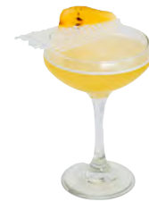
DEER & PEAR $148 Glenfiddich 12yo, Pear Ginger Cordial, Honey Glenfiddich 12 年威士忌, 薑, 梨, 蜜糖